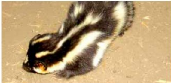
This is a spotted skunk.

Without people around, the animals became more active.